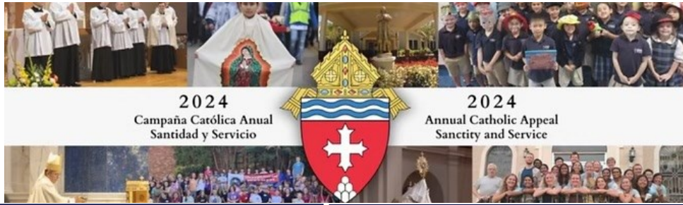
2024 Campaña Católica Anual Santidad y Servicio